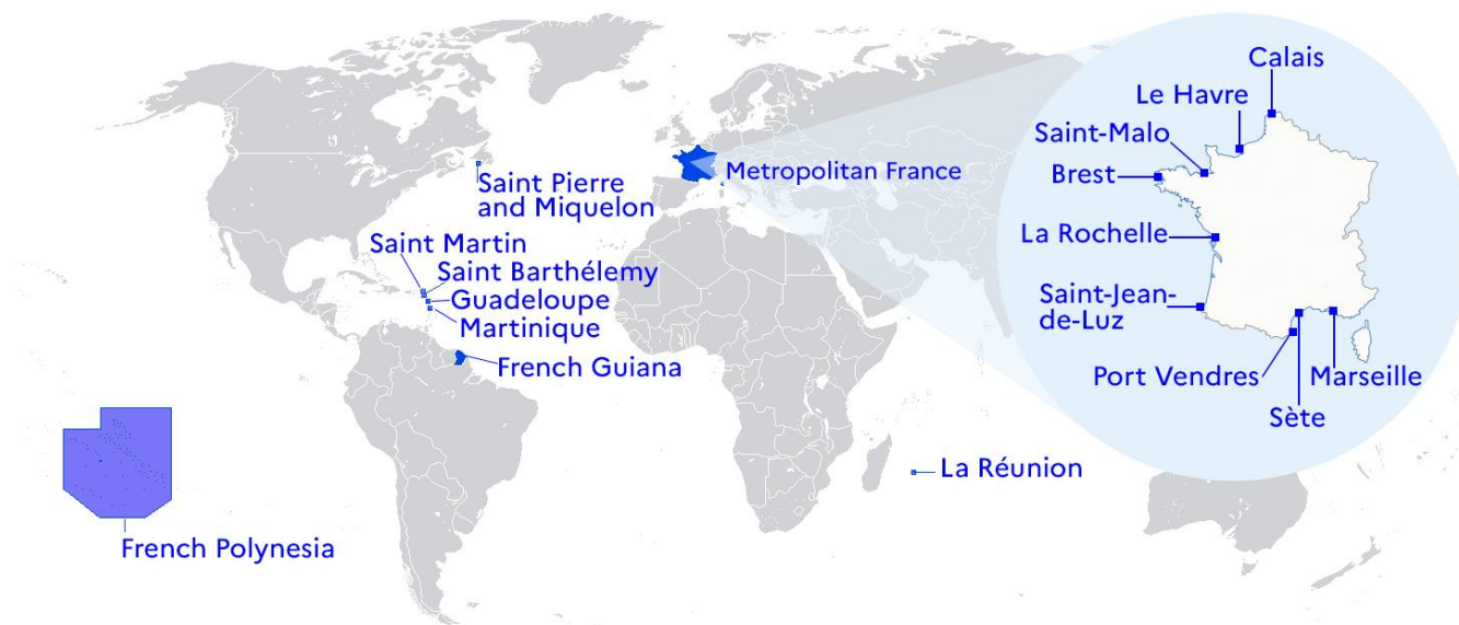
Figure 2: A map showing the French territories considered in this study.

The proposed method is applied to France and its overseas coasts (cf. Fig. 2).