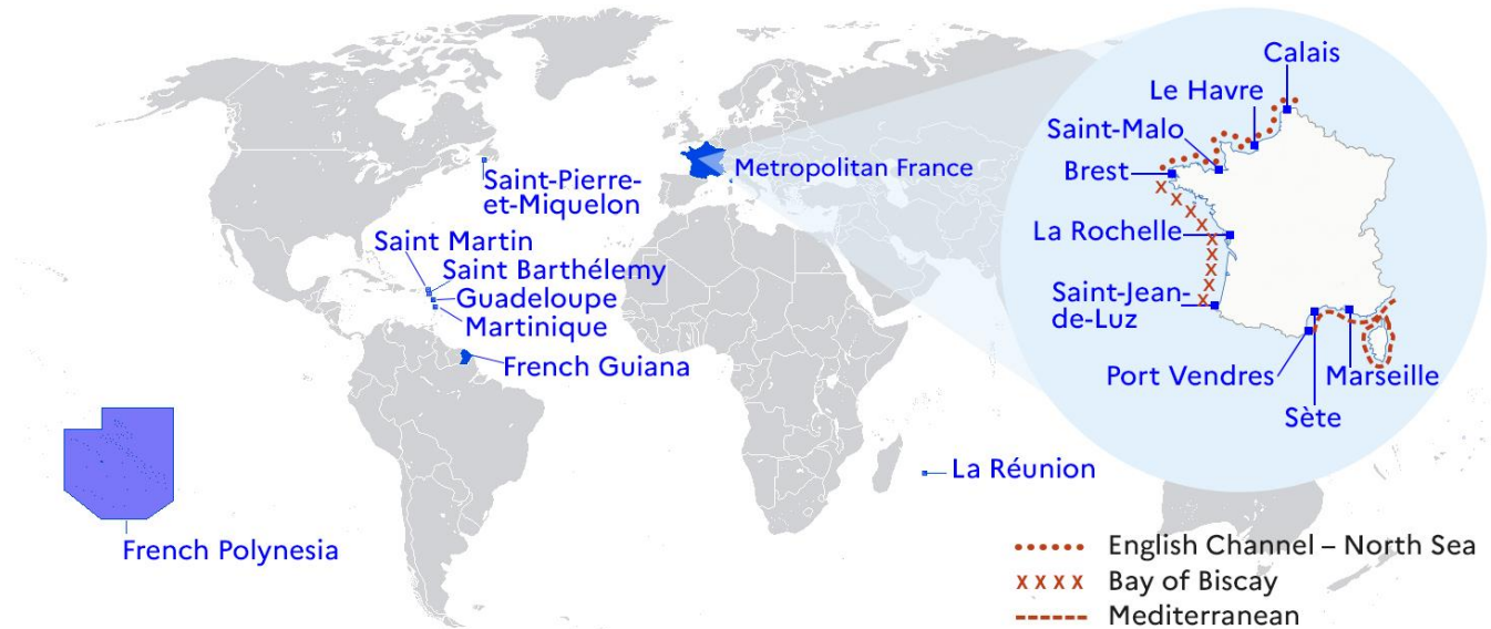
Figure 2: A map showing the French territories considered in this study.

The proposed method is applied to France and its overseas coasts (cf. Fig. 2). In the following, the islands of Saint-Martin, Saint-Barthélemy, Guadeloupe and Martinique may be referred to as the « West Indies ».