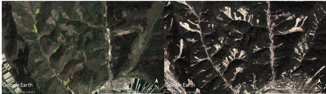
Figure 2 Remote sensing images before and after the event. (a: before the sliding-flow landslide event, b: after the sliding-flow landslide event)

table 2 : the term “area” is not appropriate ; you can use “surface area”