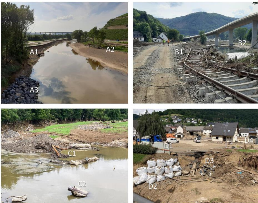
Figure 2. Damage in the Ahr Valley, Germany (11 August 2021). Top-left: destruction of federal highway B266 (A1) and railway 50 (A2) near Heimersheim, the bridge from which the photo was taken has been stabilized (A3). Top-right: further upstream in the Ahr valley (Altenburg), large stretches of the Ahrtalbahn railway have been destroyed (B1) and the few remaining road and rail bridges show signs of temporary repairs (B2). Bottom-left: river bed erosion uncovered and destroyed many cables supposed to lie more than 80 cm below surface level (C1) as well as sewers (C2). Bottom-right: inundated electricity distribution infrastructure (D1), road erosion and stabilisation (D2), uncovered cables (D3) and collapsed buildings in Schuld.