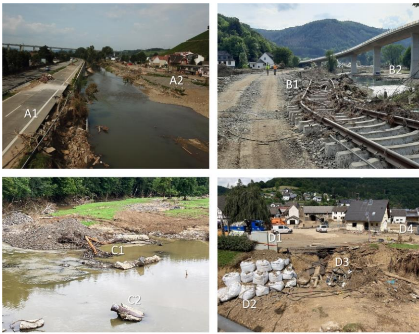
Figure 1. Damage in the Ahr Valley, Germany (images taken on 11 August 2021). Top-left: destruction of federal highway B266 (A1) and railway (A2) near Heimersheim. Top-right: further upstream in the Ahr valley (Altenburg), large stretches of the Ahrtalbahnhof railway have been destroyed (B1) and the few remaining road and rail bridges show signs of temporary repairs (B2). Bottom-left: river bed erosion uncovered and destroyed many cables supposed to lie more than 80 cm below surface level (C1) as well as sewers (C2). Bottom-right: inundated electricity distribution infrastructure (D1), road erosion and stabilisation (D2), uncovered cables (D3) and collapsed buildings in Schuld.