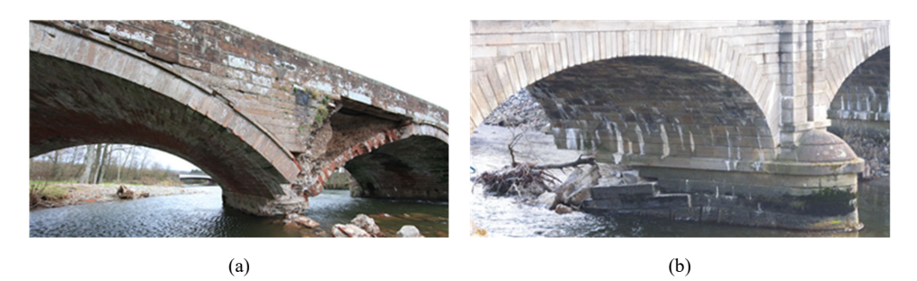
Figure 2. Damage of Brougham Old Bridge (a) and of Calva bridge (b), typical of many masonry arch bridges subjected to scour (Source: Cumbria Council County for (a) and Bill Harvey for (b)).