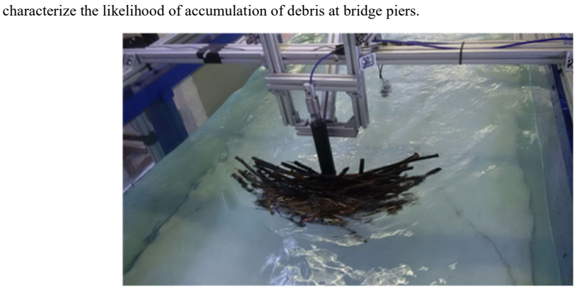
Figure 1: Debris accumulation formed in the laboratory (Panici and de Almeida, 2018).

and presents an assessment of the influence of flow intensity, blockage area ratio, and depth ratio on the development of local scour with flow-dependent debris accumulation. Debris accumulations can increase local scour depths by a factor of two or more compared to local scour depth without accumulations. The increase in scour depth that results from debris accumulations depends critically on the characteristics of debris accumulations (e.g. size and shape, which mainly determine their influence on scour) that will form at a given location, which is difficult to predict. Experiments by Panici and de Almeida (2018, 2020, Figure 1) provide methods to estimate the maximum dimensions possibly formed under given flow and debris conditions. However, additional experimental research is needed to extend the range of applicability of existing methods and approaches, and to