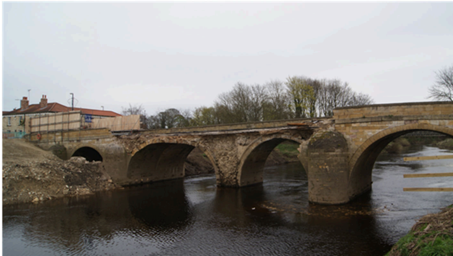
330 Figure 3. Tadcaster bridge, damaged by Storm Eva in 2015, repaired and reopened to traffic 13 months after. Bridge closure resulted in 9-mile detour of 20 minutes to reach the other side.