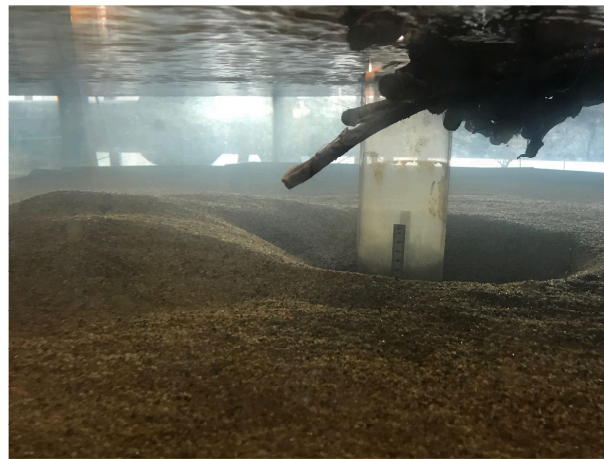
Figure 1: Debris accumulation formed in the laboratory and developed scour hole (Cantero-Chinchilla et al. 2021).

195 has a minor influence on local scour (see also Lagasse et al. 2010). Debris accumulations can increase local scour depths by a factor of two or more compared to local scour depth without accumulations. The increase in scour depth that results from debris accumulations depends critically on the characteristics of debris accumulations (e.g. size and shape, which mainly determine their influence on scour) that will form at a given location, which is difficult to predict. Experiments by Panici and de Almeida (2018, 2020, Figure 1) provide methods to estimate 200 the maximum dimensions possibly formed under given flow and debris conditions. However, additional experimental research is needed to extend the range of applicability of existing methods and approaches, and to characterize the likelihood of accumulation of debris at bridge piers. Another topic that is receiving considerable attention by researchers is the pressure-flow scour due to vertical contraction, which takes place in the case of submerged bridge deck (Carnacina et al., 2019). A recent review paper (Majid and Tripathi, 2021) discusses the 205 many research needs in this field.