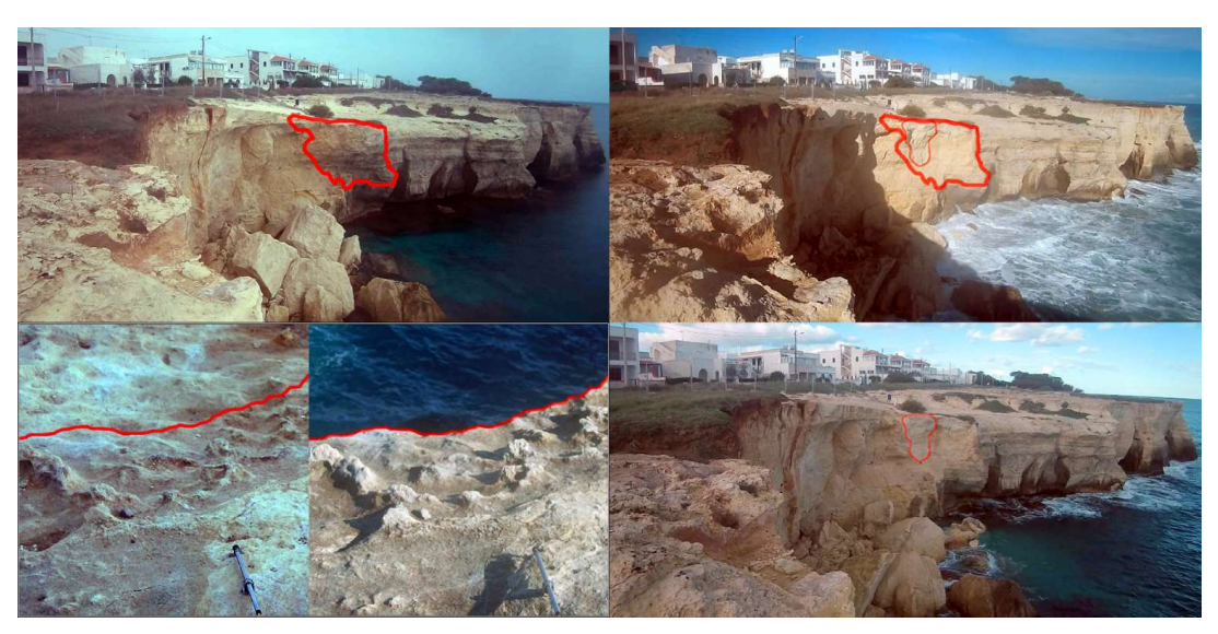
Figure 3: the second rockfall (marked with "B" on fig. 2) – Top left image shows the cliff as it was on 4 December 2020 and the top right image shows as it was on the morning of the 7 December 2020, after the main collapse (marked by the thick red line). Bottom right images shows the cliff as it was on the 8 December 2020, after a minor rockfall (marked by the thin red line). On the bottom left part, two smaller images that shows the collapse from another point of view (the main camera) both before the rockfall (on the left) and after it (on the right). On those images, the newly installed automatic crack-meter is also visible.