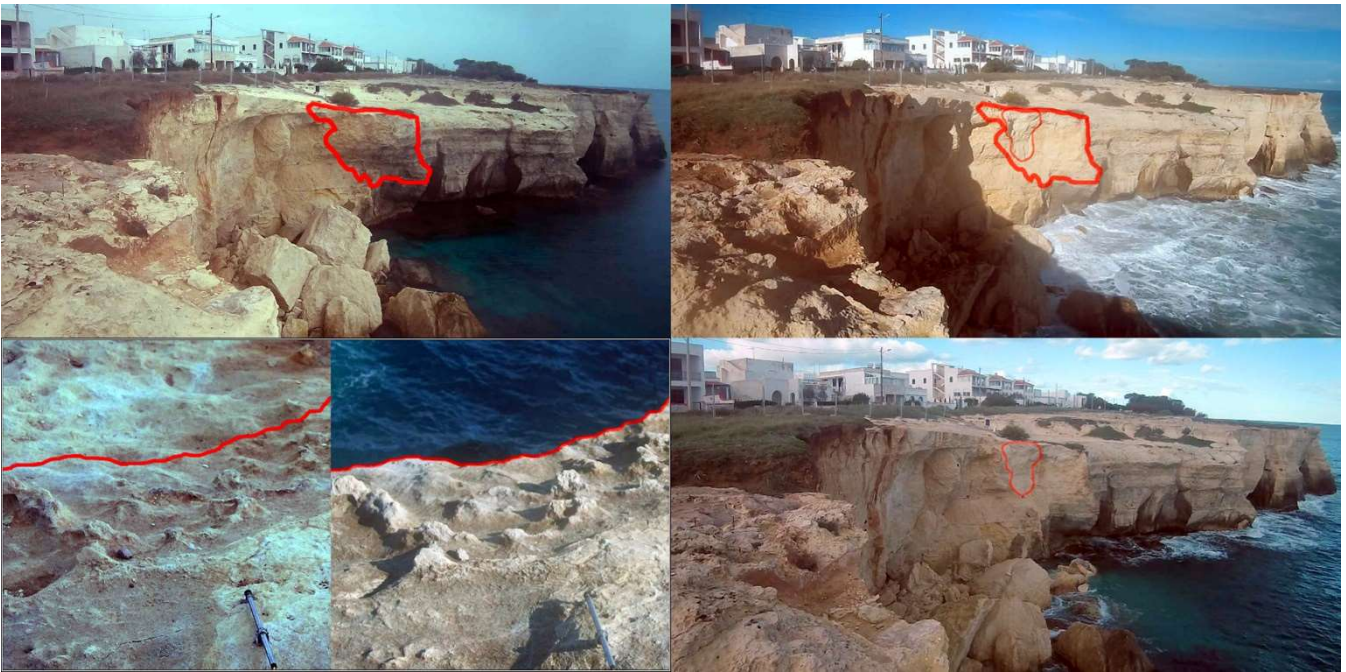
170 Figure 3: the second rockfall (marked with “B” on fig. 2) – Top left image shows the cliff as it was on 4 December 2020 and the top right image shows as it was on the morning of the 7 December 2020, after the main collapse (marked by the thick red line). Bottom right images shows the cliff as it was on the 8 December 2020, after a minor rockfall (marked by the thin red line). On the bottom left part, two smaller images that shows the collapse from another point of view (the main camera) both before the rockfall (on the left) and after it (on the right). On those images, the newly installed automatic crack-meter is also visible.