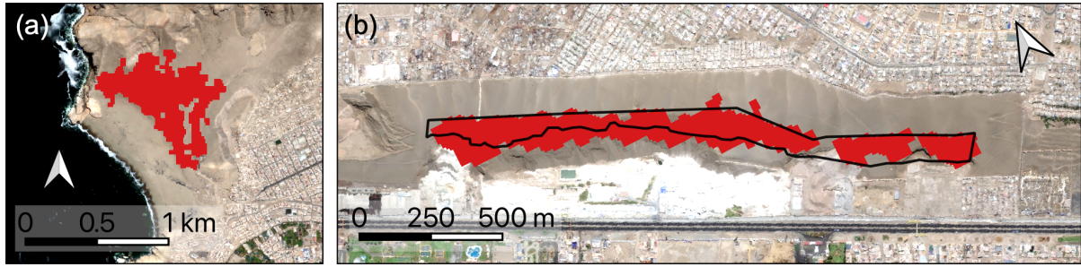
Figure 3. Sentinel-1 SAR-based map of the recent informal settlement in Morro Solar (a), and Lomo de Corvina (b).

if the backscatter intensity recorded on April 14, 2021, is greater than the threshold, it is assumed that the area is occupied.