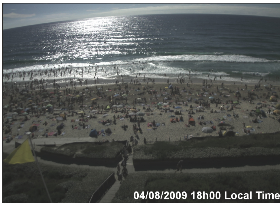
Fig. 3. Snapshot of Biscarrosse Beach at the main beach entry on August 4, 2009. The dry beach is packed with holiday-makers in the camera view field. The area is "saturated" and beachgoers all go further sou