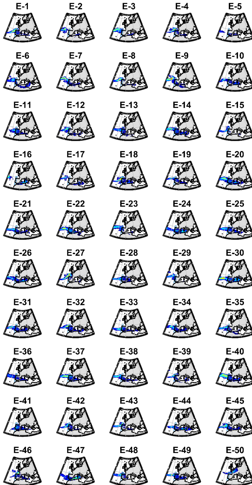
Figure S1. Ensemble forecast of the IVT in an event affecting Western Iberia on January 4 2016 for lead time -5 days.