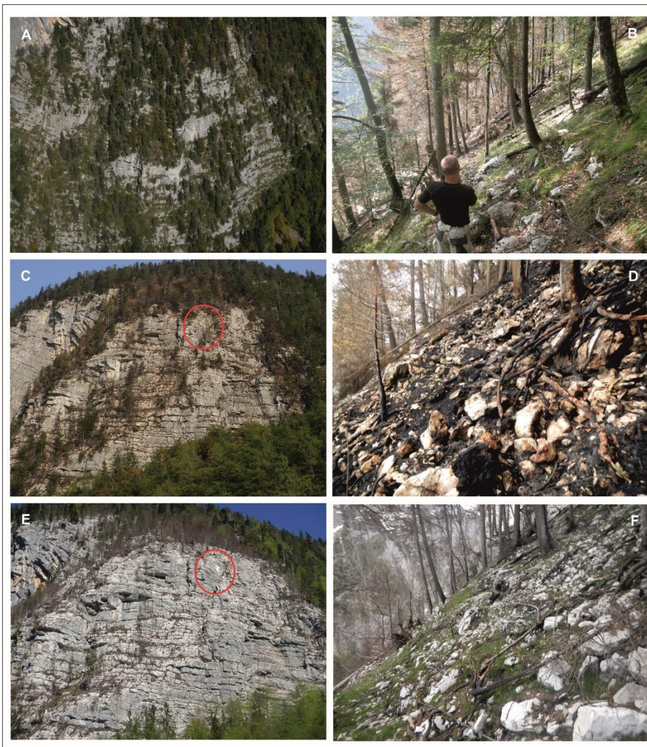
265 Figure 1: Temporal changes of the wildfire affected area: biomass, soil and rock characteristics before the wildfire in 2014 (A), in the border between burned and not-burned forest in August 2018 (B), directly after the wildfire in August 2018 (C and D) and eight months after the burn in April 2019 (E and F). Post-wildfire rockfalls (red circle in E) with a volume of about a few m 3 is recognizable.