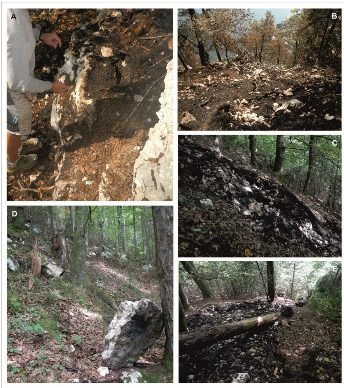
270 Figure 2: Indication for wildfire severity. (A) Development of cracks in the scree, (B) ash and needle covers the terrain have a "sealing effect" reducing the infiltration capacity, (C) Talus slope beneath the rockwall is covered by a thin soil layer, (D) rockfall boulders detached during the wildfire are often easily identifiable on the black colour, (E) the protection forest beneath the rockwall only got affected to a very minor extent due to the anabatic winds and high moisture of the brown rendzina/ brown earth.