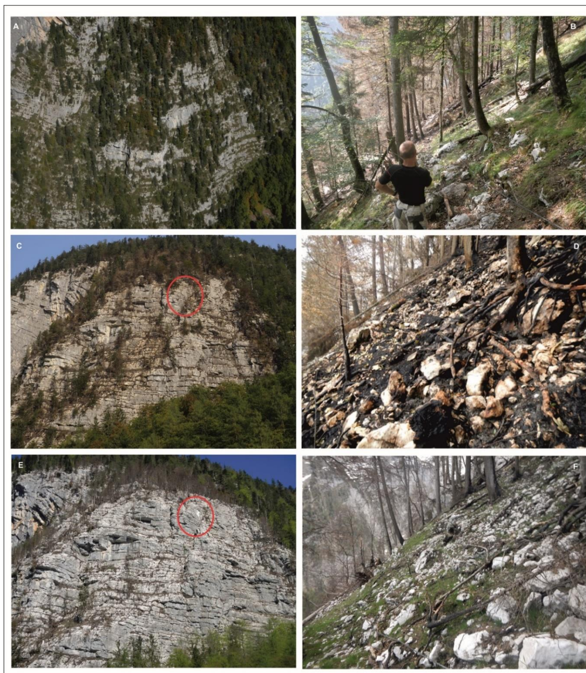
Figure 1: Temporal changes of the wildfire affected area: biomass, soil and rock characteristics before the wildfire in 2014 (A), in the border between burned and not-burned forest in August 2018 (B), directly after the wildfire in August 2018 (C and D) and eight months after the burn in April 2019 (E and F). Post-wildfire rockfalls (red circle in E) with a volume of about a few m 3 is recognizable.