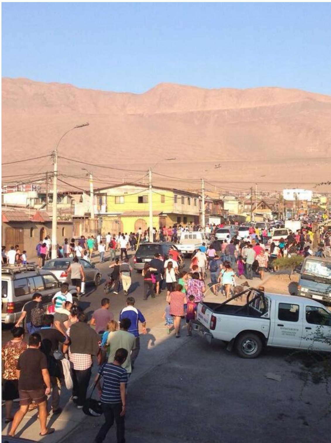
Figure 4. Preventive evacuation of 16 March 2014 (CNN Chile, 2014).