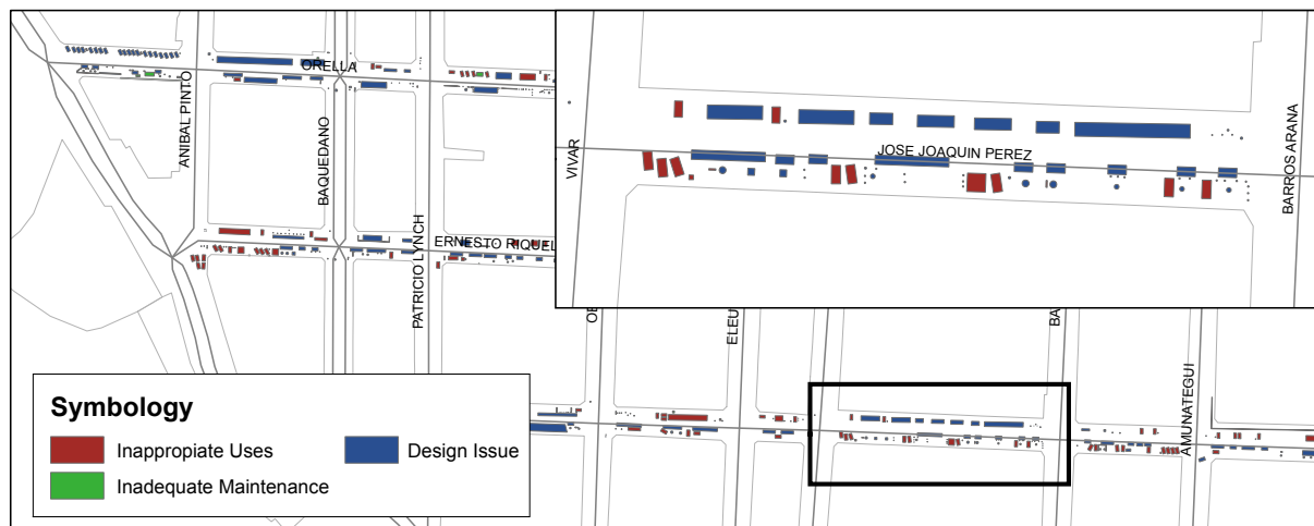
Figure 3. Mapping of identified micro-vulnerabilities, colored according to their taxonomy.