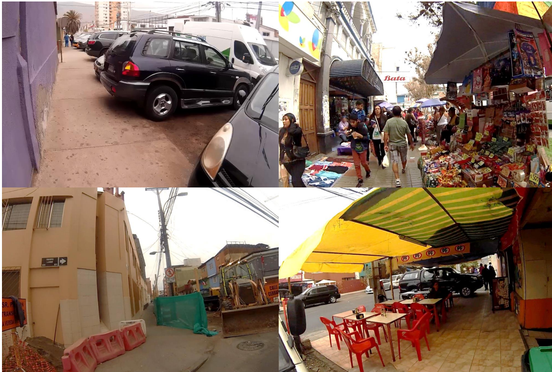
Figure 2. Still frames obtained from field recordings in the city Iquique. Improperly parked vehicles (top left), informal commerce (top right), road repairs (bottom left), restaurant tables on the sidewalk (bottom right).