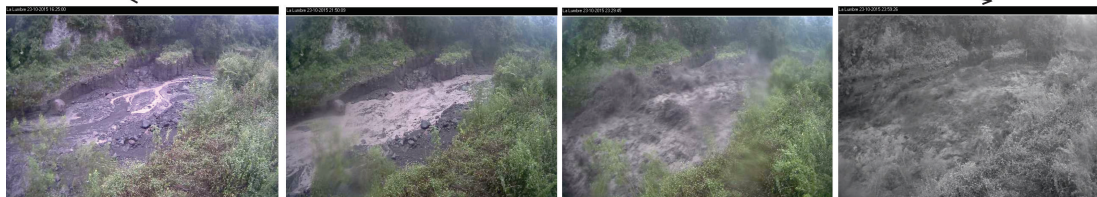
Initial water runoff First surge detected in the seismic record First main pulse Second main pulse