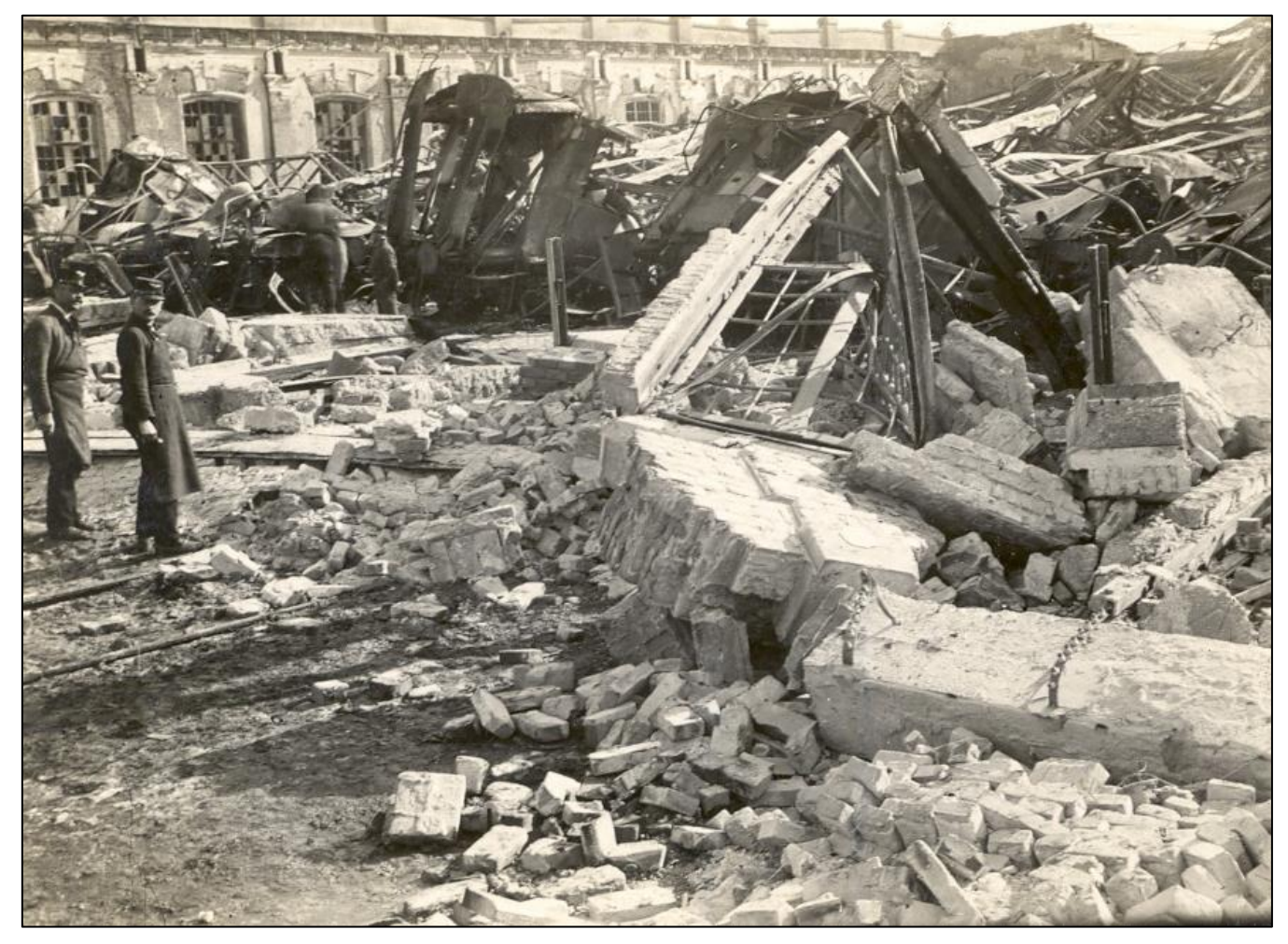
Fig. 4: F4 destruction on the plot of the old locomotive factory.

As illustrated by the aerial photograph (Fig. 5), the degree of damage varies substantially within extremely small distances, from nearly untouched to total destruction. The spatial pattern of damage substantiates a statement by Fujita and Merriam (1992): "These examples show that tornado winds are highly variable within a short distance both in wind direction and speed, necessitating the use of all types of structures in mapping the F-scale wind pattern."