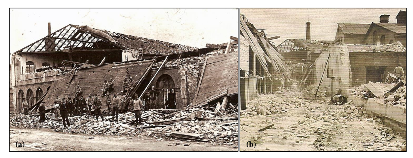
Fig. 3: Details of the old locomotive factory. Left (a): inner ceiling flipped outside, in foreground whole upper floor with massive brick walls collapsed (similar as the building parts that are still visible in the background). Right (b): Former indoor part of the same building with destruction of up to 1 m thick walls down to the ground level.

15 1916). Further east, in the vicinity of the old locomotive factory, the maximum intensity reached F4 (Figs. 3-5). The width of the damage track at this most devastated place measures about 600 m (Fig. 6).