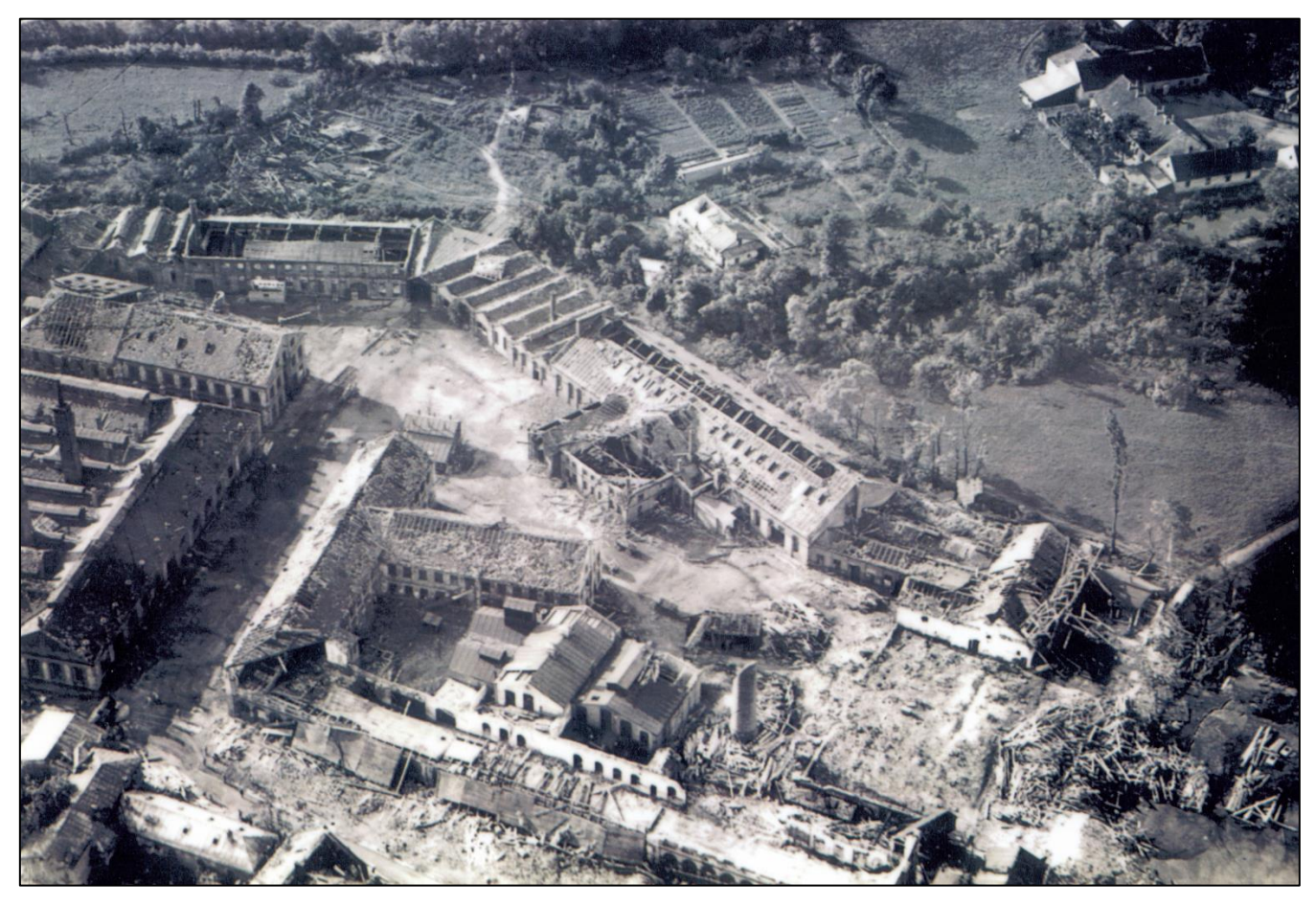
Fig. 5: Aerial view of parts of the most damaged old locomotive factory. Most destructed area in the lower right quarter of the photo.