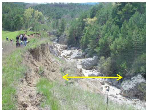
Figure 2 (top): local failure of slope toe deposited in the torrent bed; the deposits are removed by erosive activity of the torrent (middle) and new local failures are generated (bottom).