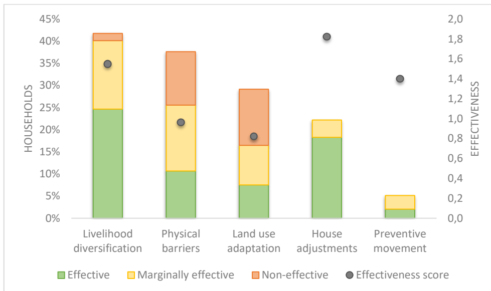
Figure 1: Uptake and effectiveness 1 of preventive measures

Most of the respondent households took preventive measures against impacts of landslides and other extreme events (65%). Among these households, 41.6% attempted to diversify their livelihoods by engaging in different economic activities, and 37.6% placed physical barriers, mostly gabions, on the hillsides (Figure 1). For each preventive measure, respondents indicated how effective they thought it had been at minimizing landslide impacts. House adjustments (using stronger building materials or moving to a safer location) and pro-active migration were seen as most successful (see the dots in Figure 1). Placing physical barriers and land-use adjustments, on the other hand, were the least successful measures. We generally found that respondents had not expected a landslide of this scale, which limited the effectiveness of preventive measures that households adopted.