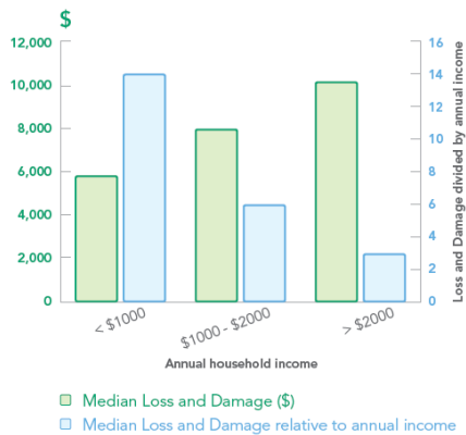
Figure 2: Monetary L&D by income group

As part of the questionnaire survey, respondents were asked about their perceptions of gender and age differences in the severity of landslide impacts. While a majority of respondents (59.8%) thought that men and women were equally affected, 29.1% believed that women were more affected. A common explanation was that men can run faster, and are more likely to escape when landslides hit. For differences in impacts between age groups, about half (51.3%) said that all groups were impacted equally. About a quarter (26.9%) thought that children suffered most from landslide impacts. This was mainly because on top of the other consequences, many children could not go to school for months after the landslide. Respondents who mentioned that elderly were affected most (10.7%) indicated that the elderly were not fast enough to escape and relocate to safer places. In sum, the majority thought that men and women and different age groups incurred similar landslide impacts but some respondents did identify differences.