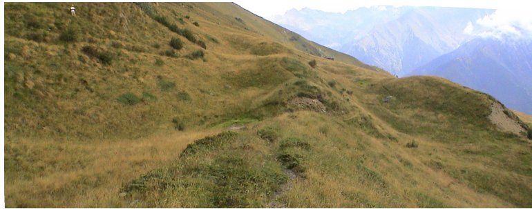
Figure 8. Watershed of tributary of the Soana stream, incised in a deep-seated slope collapse deposit; typical features include trenches and counterslope surfaces, often with emergent water (Photo 31 July 2003).