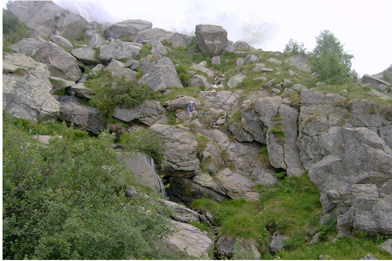
Figure 6. In a steep-sloping sub-catchment in the upper Orco Valley, the right slope, affected by a deep-seated gravitational process, is underlain by disjointed earth blocks and extremely uneven ground surface (Photo 12 July 2004).