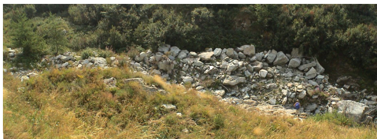
Figure 9. Residual deposit of a debris flow (October 2000), which shows typical inverse gradation, along a left tributary of the Soana stream (Photo 8 August 2003).