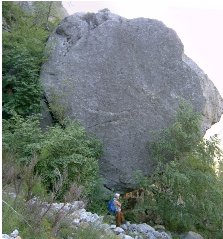
Figure 7. An example of the huge, disjointed stony blocks outcropping on the left slope of the Orco Valley, behind a settled area few hundreds meters downslope (Photo 21 July 2004).