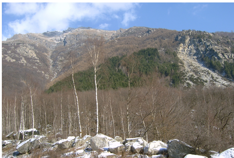
Figure 3. Frontal view of a minor catchment left to the Orco stream in which slope instability processes can be seen towards right; these have been re-activated in October 2000. In the foreground, mountain birches can be seen, on the left side of the catchment, in a 75 year old reforested area (Photo 25 February 2005).