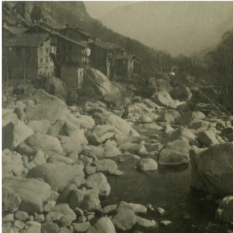
Figure 2. A village in the high Orco basin: very coarse deposits in the main channel as depicted in an old photograph (year 1952).