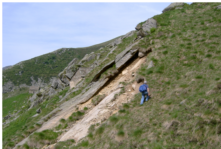
Figure 5. Right slope of a major catchment in the Orco Valley, near the stream head: a rock fall/soil slip process triggered by the extreme rainfall event of October 2000. The matrix-dominated nature of the materials is noteworthy and is connected to weathering products of the bedrock (Photo 11 June 2004).