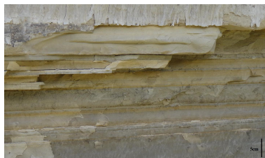
Fig. 4. Structure of lacustrine sediment in the Diexi barrier lake