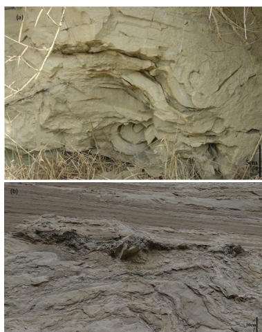
Fig. 11. Earthquake-induced disturbance layer in the sediment exposed on an outcrop