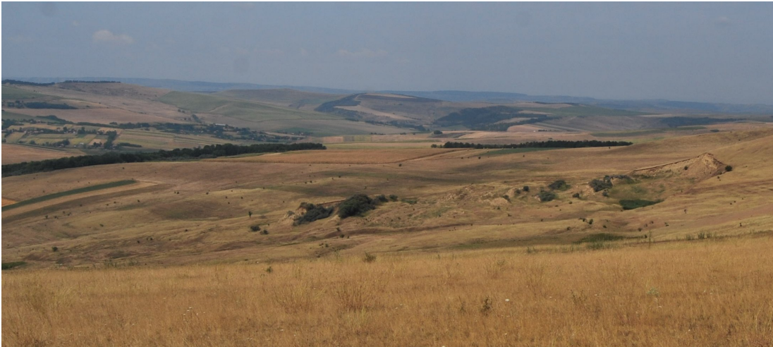
Fig. 1. Figure 1. Deep-seated landslide in Transylvanian Plateau, locally named glimee (Căpușu de Câmpie sector).