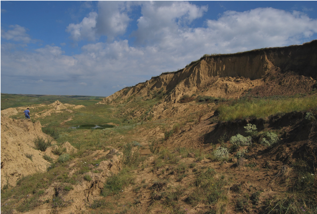
Fig. 3. Figure 3. Deep seated landslide in Moldavian Plateau (Șipote sector).