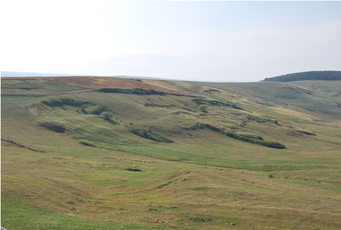
Fig. 5. Figure 5. Shallow landslide in Şipote sector, detail from Figure 4.