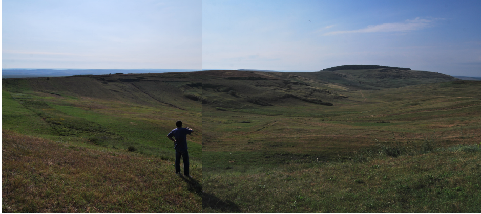
Fig. 4. Figure 4. Semicircular depression shaped by complex geomorphological processes (hârtop in Molvavian Plateau, Şipote sector).