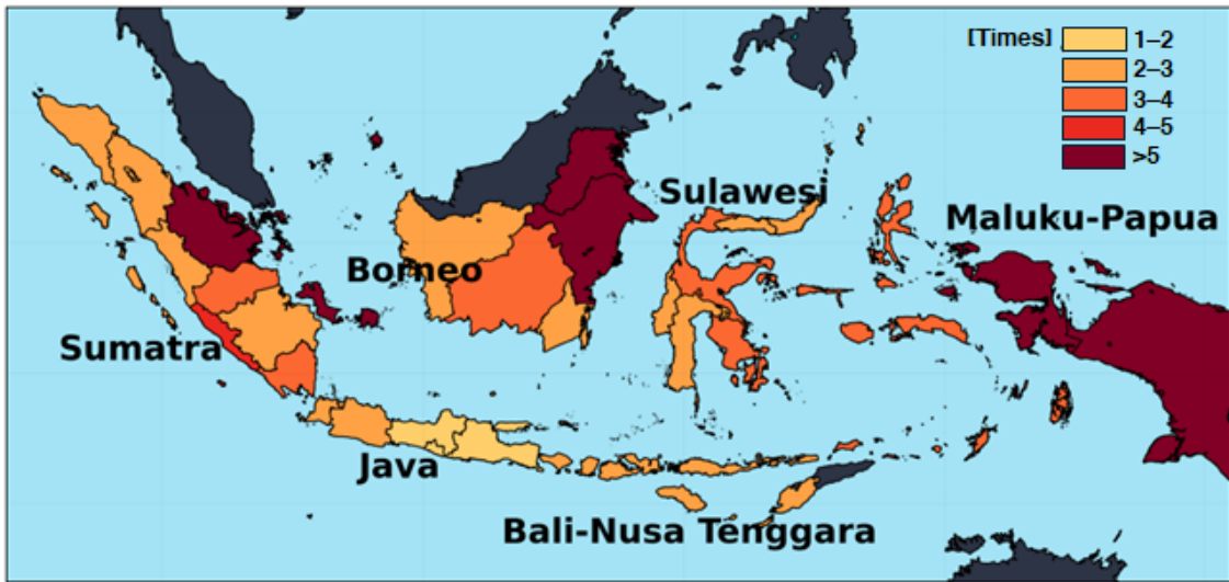
Figure S2. The population growth of Indonesia. The population growth of Indonesia is calculated by dividing the population Indonesia in 2024 and 1971.