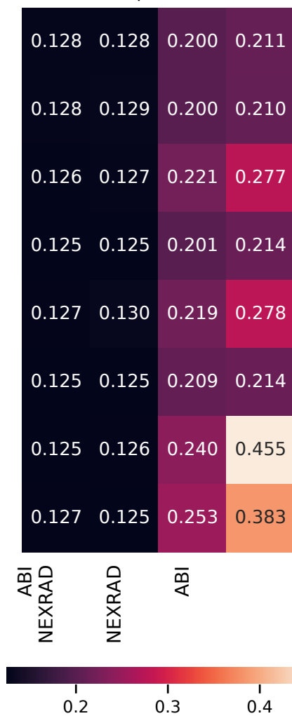
(b) 45 dBZ ET presence error rate