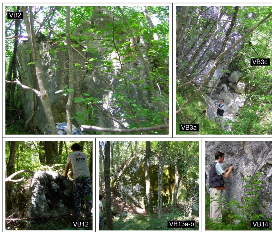
S1a: Photos of the ^{36}\text{Cl} dated boulders with sample names indicated (Table 1), locations shown on Fig. 3.

VB14. Sample comes from a decametric boulder of Calcari Grigi Group. whitish oolitic limestone on the left side of Cordevole River, near samples VB3a and VB3c. Thin section shows a peloidal packstone with ooides and bioclasts. Oolites have a concentric and radial structure, bad preserved due to the advanced state of micritization. Bioclasts are gastropods, different species of foraminifer, bivalve and echinoderm fragments.