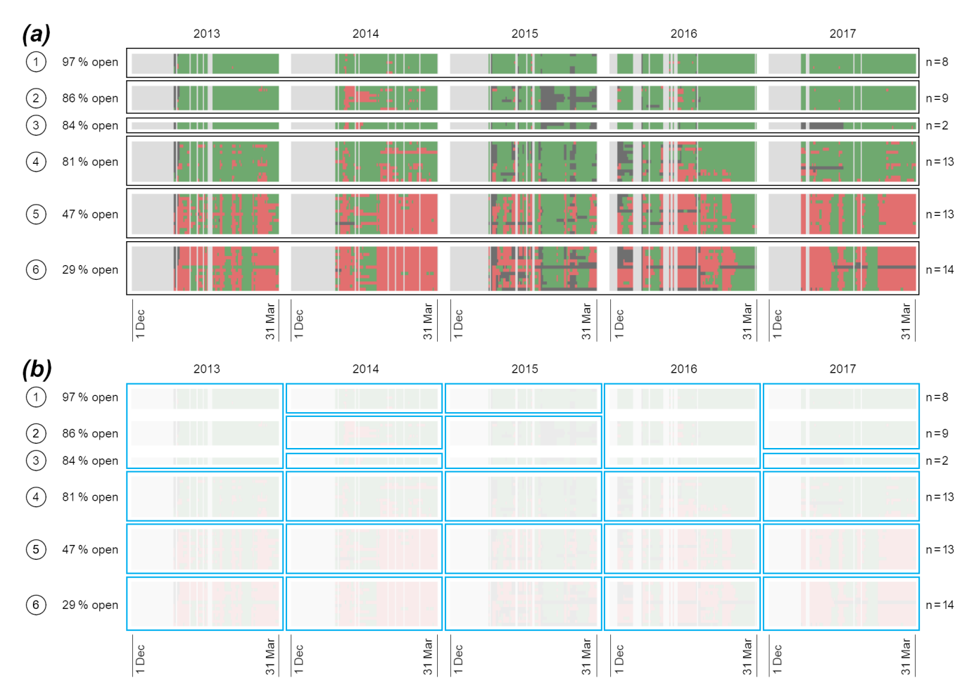
Figure 1. Identified ski run hierarchy with groups of similarly managed ski runs at NEH with (a) typical time series of run list ratings for the winter seasons from 2013 to 2017 and (b) inter-seasonal variation within the ski run hierarchy. The time series strips of each group consist of colour-coded rows representing the run list ratings of the individual runs included in that group. Taller strips therefore represent groups with larger numbers of runs. Days when ski runs were open are shown in green, days when they were closed due to avalanche hazard are shown in red and days when they were not discussed or closed due to non-avalanche-hazard-related reasons are shown in black. Days with no run list data at all (e.g., prior to operating season, days when operation was shut down due to inclement weather conditions) are shown in grey. Panel (b) shows the identified within-season clusters (blue boxes) with multi-season ski run classes faded.

SOMs with varying numbers of nodes, we selected a robust SOM solution with 6 \times 3 nodes that optimized the quantization and topographical errors. Based on the visualization of the node dissimilarities in the clustering dendrogram, we chose a final solution that consisted of six groups of ski runs.