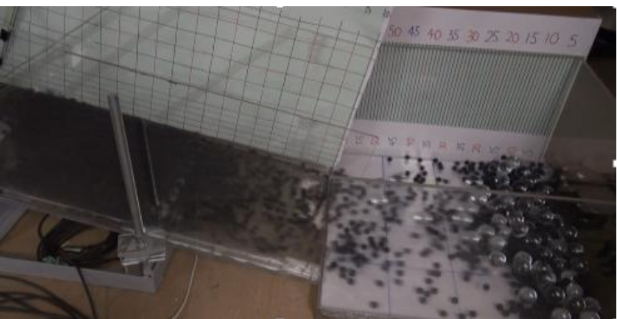
(c) The influence of particle size and density on the segregation process