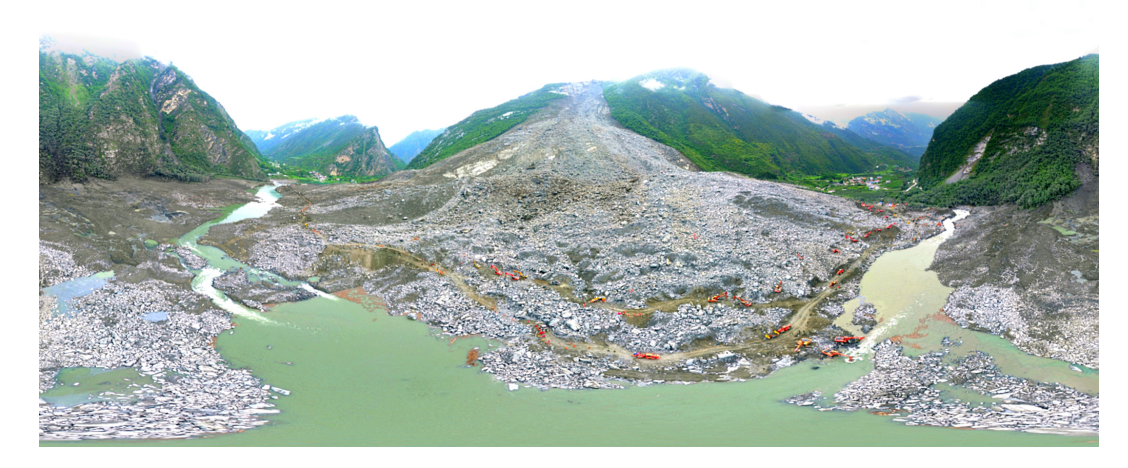
Figure 1. Panoramic view of the Xinmo rock avalanche as seen from the opposite slope. Notice the red trucks for the scale.

areas of Japan (Okamoto et al., 2012), and a clear tendency for landslides to occur more frequently due to past earthquakes has been found in New Zealand (Parker et al., 2015). Several recent landslides in Sichuan, China, have been correlated with the M_s 7.5 Xichang earthquake (Wei et al., 2014), which occurred more than 160 years ago.